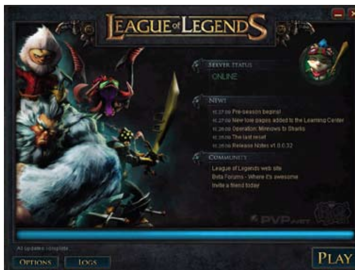
Sample DIRECT interface for Riot Games' League of Legends

To interface directly with your players is a distinct advantage because it allows you to develop a stronger connection with your audience which ultimately builds a stronger sense of loyalty from your players. It also opens new channels for promotion and monetization of your game(s).