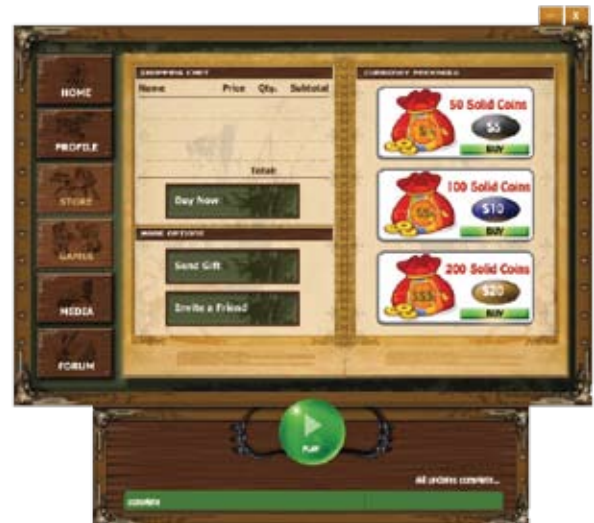
Sample DIRECT launch interface which features navigation tabs and the ability for players to purchase game currency.