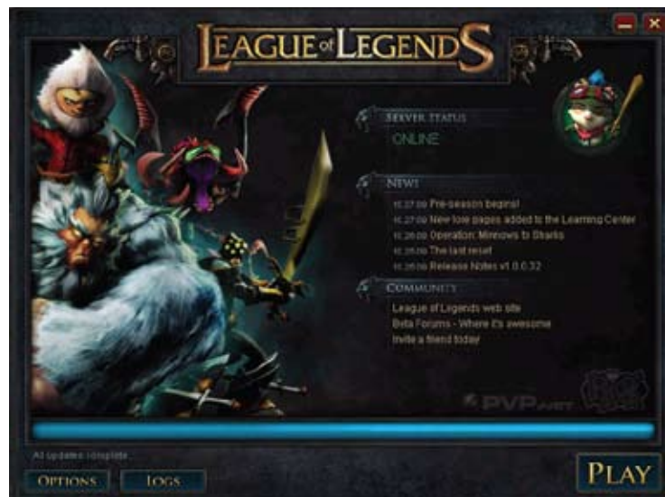
Sample DIRECT interface for Riot Games' League of Legends

To interface directly with your players is a distinct advantage because it allows you to develop a stronger connection with your audience which ultimately builds a stronger sense of loyalty from your players. It also opens new channels for promotion and monetization of your game(s).